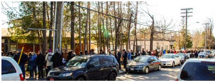
Both the line-up and the anticipation build before the doors open on the 2016 Book Sale.

It was a banner year for our annual April Book Sale in support of the Rockcliffe Park branch of the Ottawa Public Library (OPL). After struggling for years with cramped quarters, we rented a 60x40 foot tent, which, with the space provided by the Community Hall and the library, allowed us to display our books and AV material to greater advantage. A slightly later date in April brought us better weather so we benefitted somewhat from spring fever.