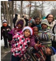
Happy participants at the 2016 RPRA Children's Christmas Party.