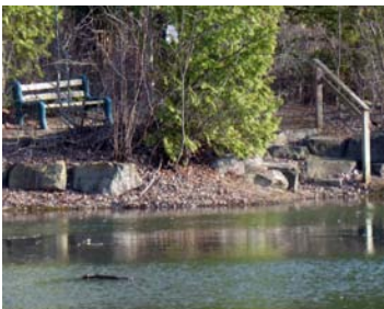
Heavy usage of the Pond, along with dropping water levels, has led to concerns for its sustainability.