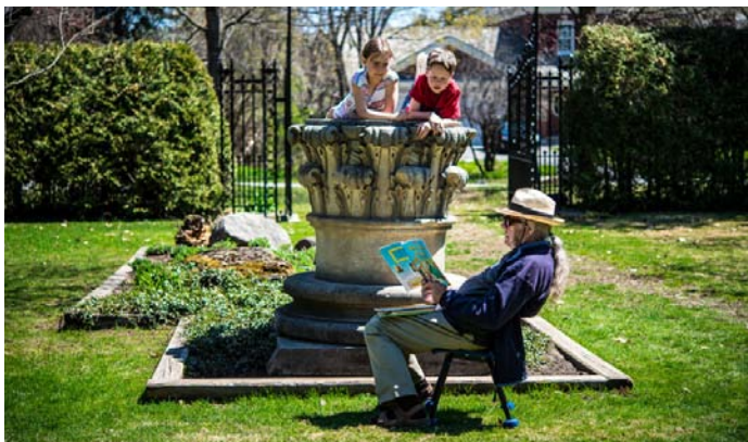
Rockcliffe Park Public School held their annual Grandparents Reading Day on May 5. One hundred forty grandparents joined us for reading day and our School Council provided lunch.

The event took place on Tuesday, May 10 in the east block courtyard of Parliament Hill and featured Actua network member, the University of Ottawa’s Makerspace and Ladies Learning Code’s code:mobile.