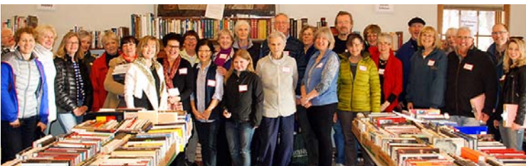
Sale Day volunteers.