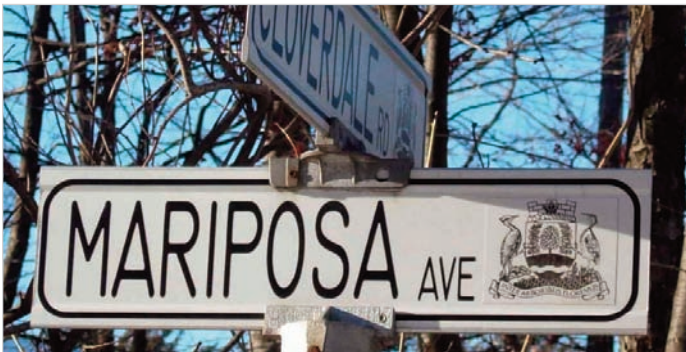
The old street signs...

Last year, residents called the City to report a number of missing street signs in the Village. In planning to replace them, City staff realized that the existing street sign design was unilingual, so a new design for the heritage district was required. The RPRA Heritage Committee was contacted, and we considered design options. We looked at the distinctive street signs now in place in each of the other heritage districts in Ottawa. Having a distinctive sign helps to identify the dimensions of a heritage district. One requirement of the City was to have the Ottawa 'swirly O' at the top centre of the sign. This is a feature of all new street signs throughout the City, including heritage districts.