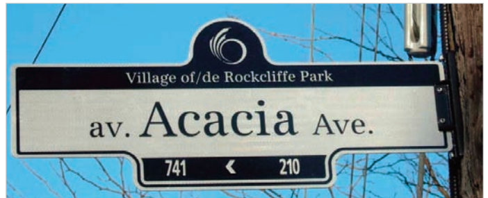
...and the new design.

The Heritage Committee found that combining the 'swirly O' with the former Village coat of arms as a district identifier wouldn't work from a design point of view, and we also realized that the coat of arms would not be recognized by many visitors. So we borrowed an idea from the Byward Market signs, and chose to have the heritage district name 'Village of/de Rockcliffe Park' written out. Two of us then sat down with the City sign designers in front of their computers, and together came up with the design now being installed to replace the missing signs. The design staff were most helpful and cooperative.