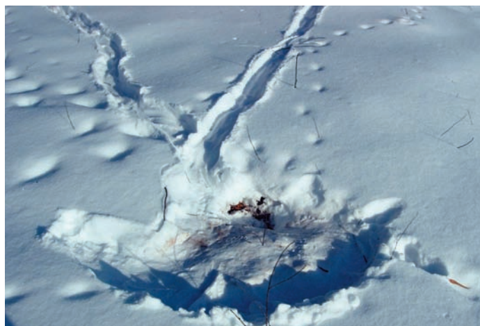
Otter tracks and roll site; den entrance where vegetation shows.

Crows are mostly absent from the Village in the depths of winter. The territorial behaviour in the breeding season