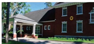
The German Ambassador's residence, one of three Rockcliffe Park homes on the 2015 IODE tour.

Shuttles will be available. Tickets are $30.00 each. Go to http://laurentian.iode.ca/event/54th-annual-iode-house-and-garden-tour for details and payment options.