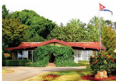
Photo: Greenhouses at Cuba's Jardín Botánico Nacional, from http://www.havana-live.com/news/2014/07/29/cubas-botanical-garden-a-tropical-treat.html