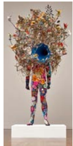
Nick Cave's Sound Suit.