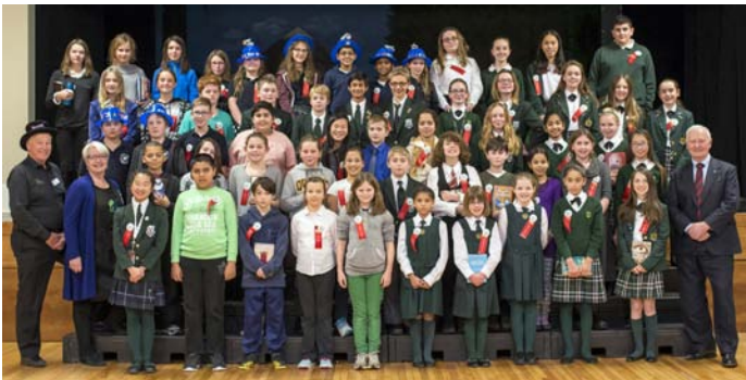
Students from across Ottawa gathered at Elmwood for the Kids' Lit Quiz Inaugural Ottawa Tournament.

On Monday, January 18, Ottawa's most voracious young readers descended on Elmwood's gymnasium to take part in the inaugural Ottawa Kids' Lit Quiz tournament. For more than two decades, this competition has been inspiring students to become lifelong readers with a fun and challenging tournament that rewards the team with the broadest and deepest knowledge of children's books.