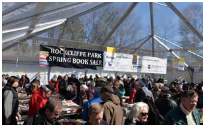
The transparent ceiling on our tent ensured plenty of light for browsing.

The Sale was a huge success from so many perspectives. Compared to 2017, we welcomed 11 percent more patrons, our higher-quality books sold six percent more, and our revenues increased by approximately 12 percent.