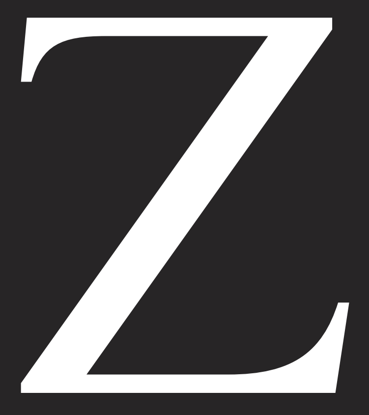
Zoning See: the City of Ottawa website, ottawa.ca; search 'Zoning'